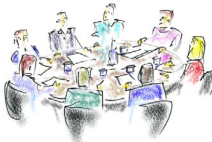
(Cartoon is "borrowed" from the Internet)