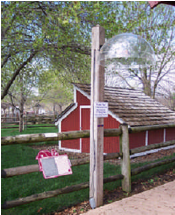
(Above) Another one of the Braille signs, this one posted beside an Audio Dome. (Opposite) An enlarged view of the sign that thanks OPHLC for providing the Audio Domes.