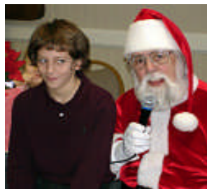
(Left) Lucky Santa—lots of pretty girls sat on his lap at breakfast! (Right) A little apprehension showing here—maybe Santa will leave a lump of coal!